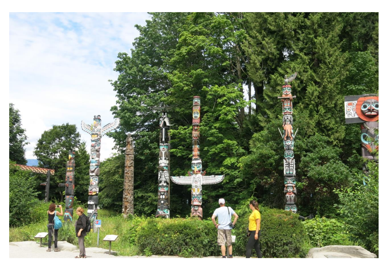
Figure 4. Totem poles at Stanley Park.