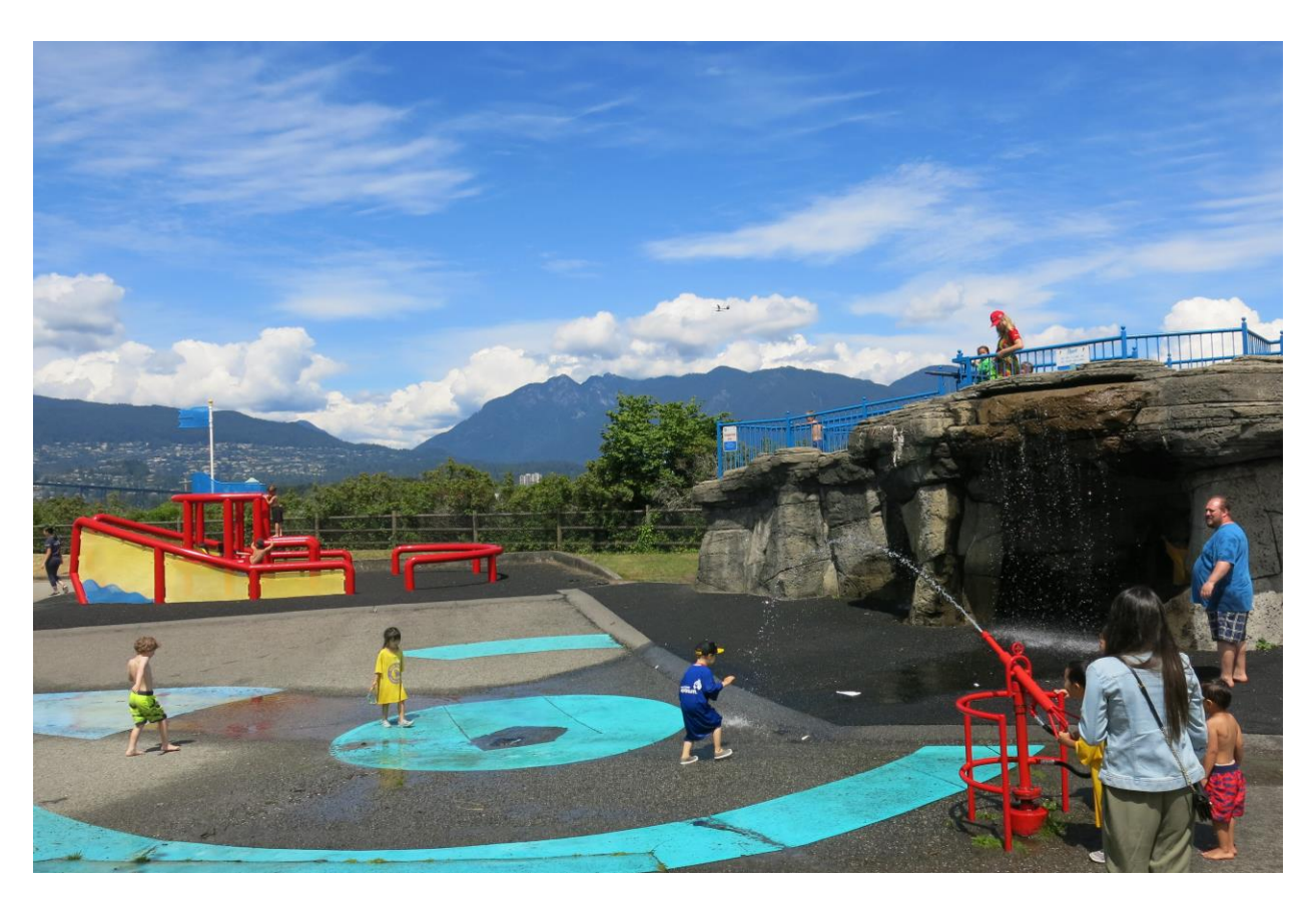
Figure 3. Water fights! They had a nearby 'child drier' - at Stanley Park.