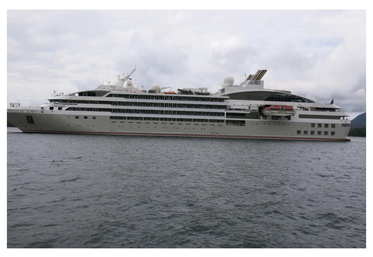
Figure 6. Le Soleal