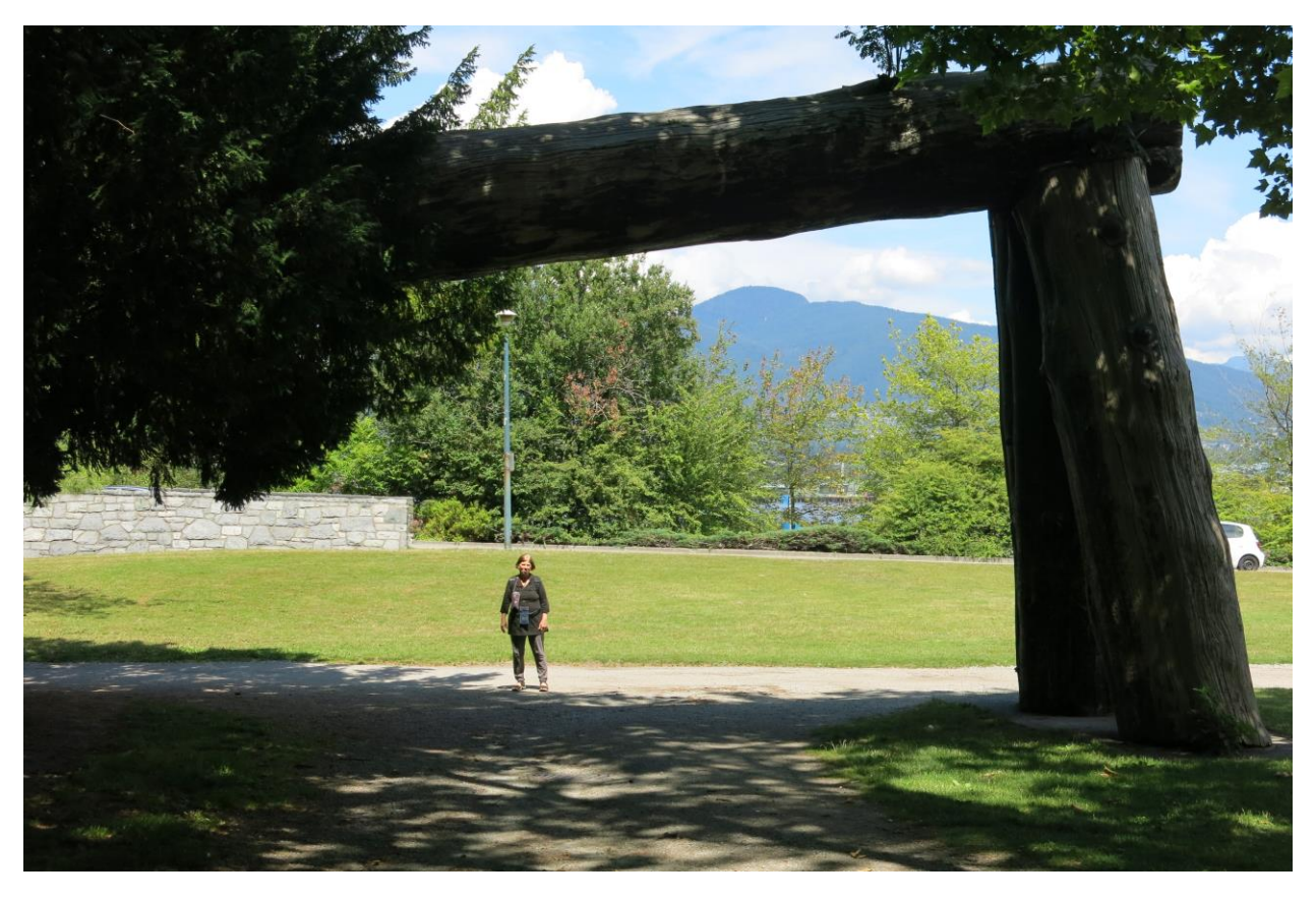
Figure 1. Lumberjack monument, Stanley Park

Friday we visited huge Stanley Park, which is on a peninsula jutting to the north of downtown Vancouver. We wandered about the eastern part of the park, mostly along the coast line, and visited memorials to Japanese-Canadian soldiers who fought in WWI and wars thereafter, and an interesting collection of totem poles, while enjoying the view of the harbor and downtown. In the evening we attended Erev Shabbat services at a conservative synagogue not far from our lodgings. Nice service, held outdoors, but little interaction with the congregants (two similarities to the synagogue in Portland). We appreciated even more our congregation Torat Hayim which would never allow a stranger to escape without friendly greetings.