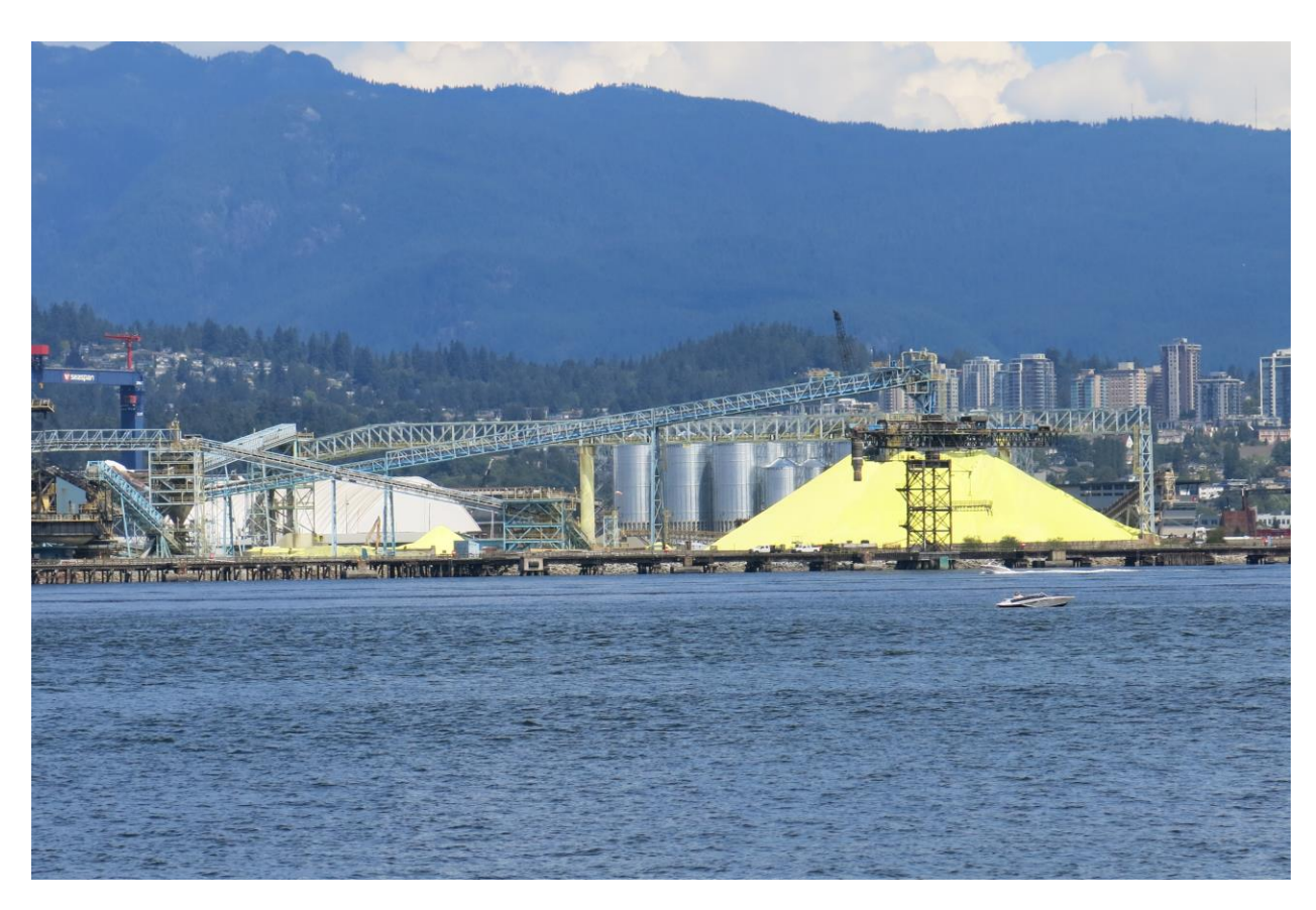
Figure 2. Sulfur harbor - view from Stanley Park